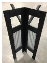
INSIDE COR. ASSY.