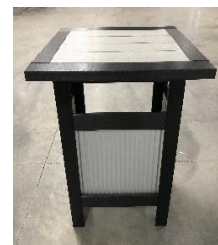
20" BAR ASSY.