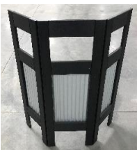
OUTSIDE COR. ASSY.