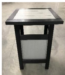
34" BAR ASSY.