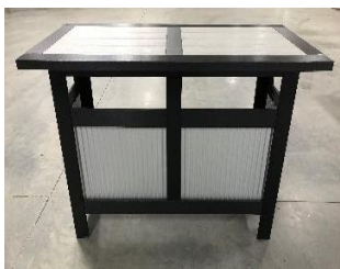
60" BAR ASSY.

STEP 1: Lay all pieces (as needed) on a smooth soft surface, such as cardboard or carpet to help avoid scratching. Be careful to not over tighten any of the fasteners.